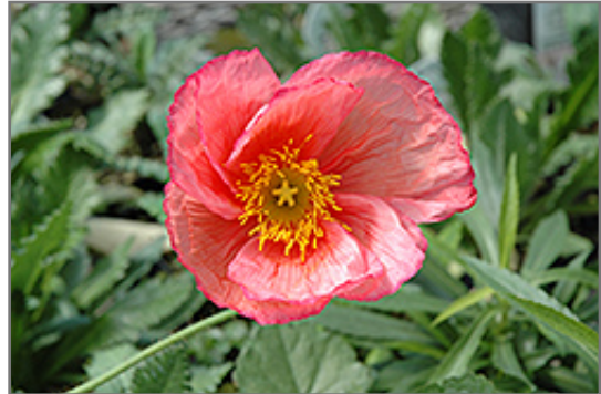
Champagne Bubbles Poppy flowers

* This is a 'special order' plant - contact store for details