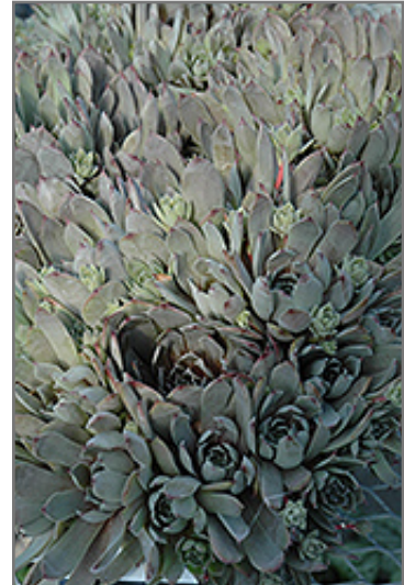
Big Blue Hens And Chicks