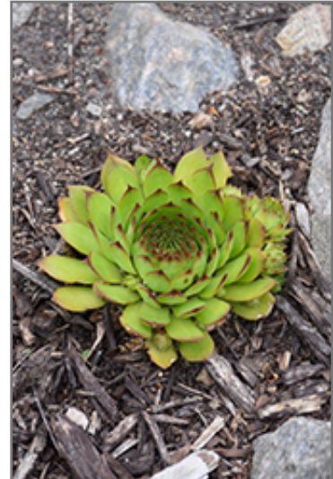
Sunset Hens And Chicks

Sunset Hens And Chicks is recommended for the following landscape applications;