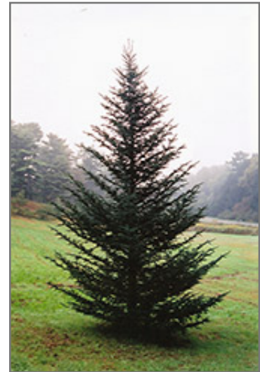
Fraser Fir