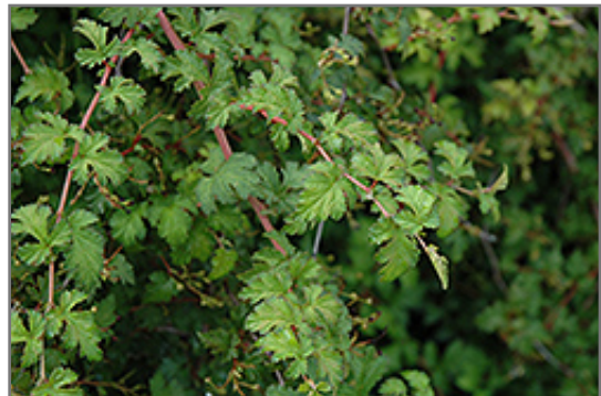
Cutleaf Stephanandra foliage