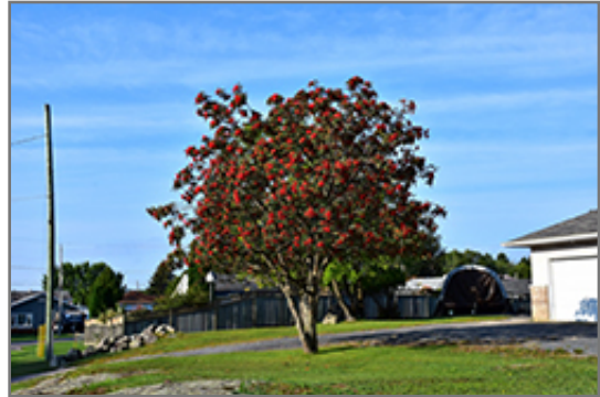
Showy Mountain Ash fruit

Showy Mountain Ash is recommended for the following landscape applications;