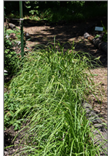
Gray's Sedge

* This is a 'special order' plant - contact store for details