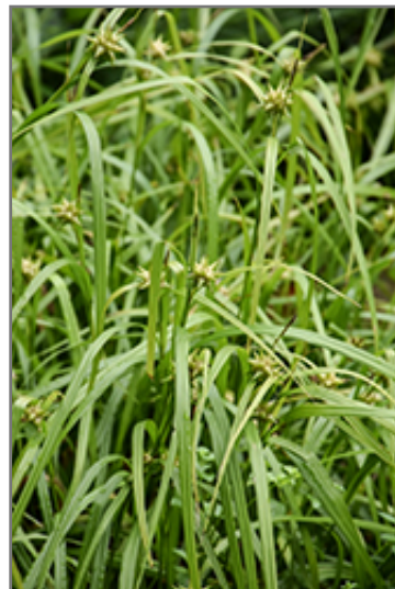
Gray's Sedge flowers