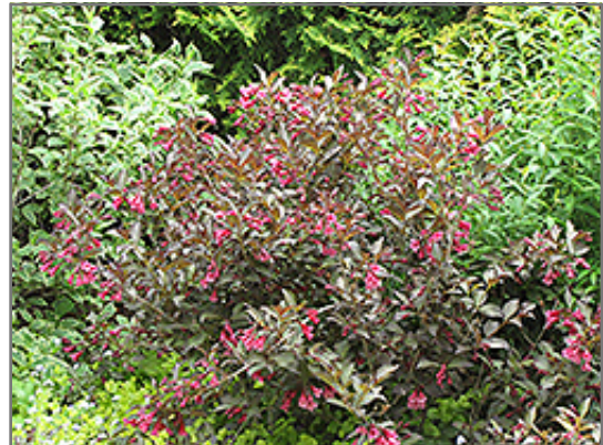
Midnight Wine Weigela in bloom

Midnight Wine Weigela is recommended for the following landscape applications;