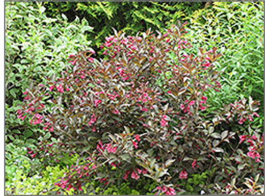
Midnight Wine Weigela in bloom

Midnight Wine Weigela is recommended for the following landscape applications;