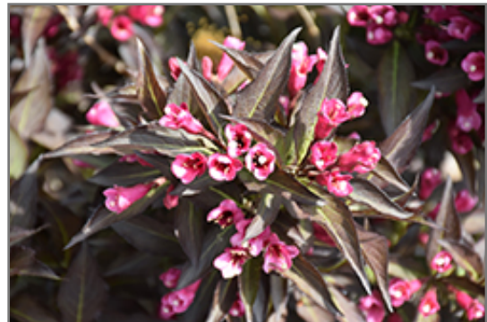
Midnight Wine Weigela flowers