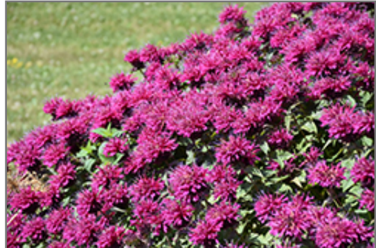
Grand Marshall Beebalm flowers