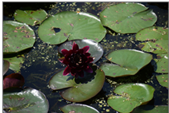
Black Princess Hardy Water Lily flowers