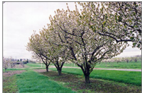
Sweet Cherry in bloom