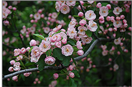
Bechtel's Flowering Crab flowers

Bechtel's Flowering Crab is recommended for the following landscape applications;