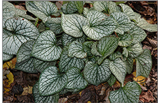
Jack Frost Bugloss foliage

This is a relatively low maintenance plant, and should be cut back in late fall in preparation for winter. It has no significant negative characteristics.