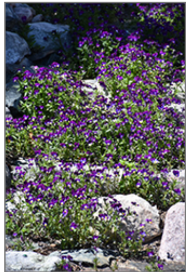
Johnny Jump-Up in bloom