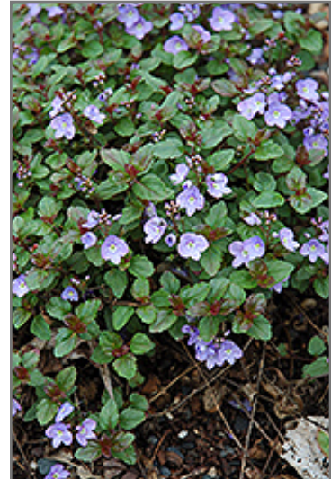
Waterperry Blue Speedwell in bloom

Waterperry Blue Speedwell is recommended for the following landscape applications;