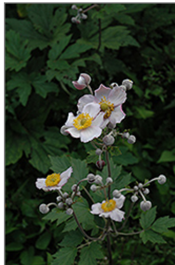
Grapeleaf Anemone flowers

Grapeleaf Anemone is recommended for the following landscape applications;