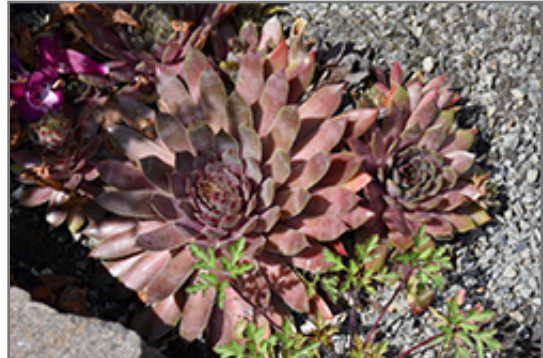
Kalinda Hens And Chicks