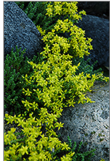
Six Row Stonecrop flowers