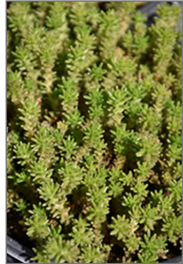
Six Row Stonecrop foliage

Six Row Stonecrop is a fine choice for the garden, but it is also a good selection for planting in outdoor pots and containers. Because of its spreading habit of growth, it is ideally suited for use as a 'spiller' in the 'spiller-thriller-filler' container combination; plant it near the edges where it can spill gracefully over the pot. Note that when growing plants in outdoor containers and baskets, they may require more frequent waterings than they would in the yard or garden.