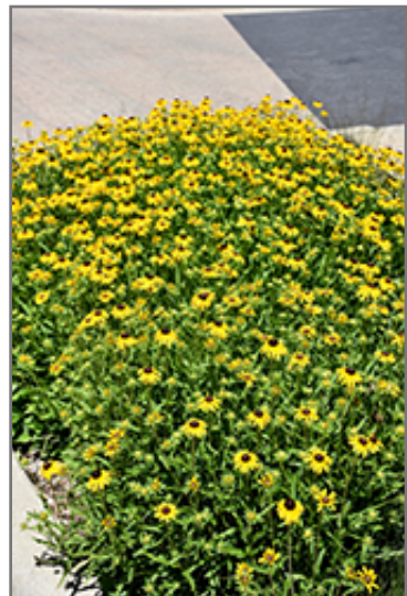
Viette's Little Suzy Coneflower in bloom