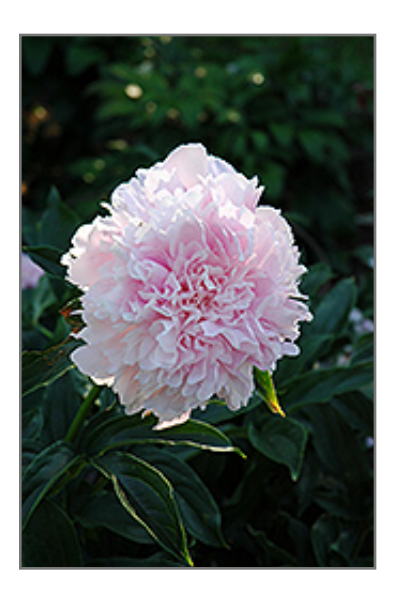
Dinner Plate Peony flowers

Dinner Plate Peony will grow to be about 30 inches tall at maturity, with a spread of 3 feet. When grown in masses or used as a bedding plant, individual plants should be spaced approximately 30 inches apart. The flower stalks can be weak and so it may require staking in exposed sites or excessively rich soils. It grows at a slow rate, and under ideal conditions can be expected to live for approximately 20 years. As an herbaceous perennial, this plant will usually die back to the crown each winter, and will regrow from the base each spring. Be careful not to disturb the crown in late winter when it may not be readily seen!