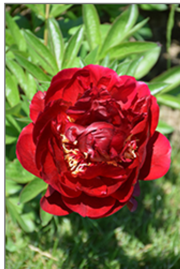
Buckeye Belle Peony flowers