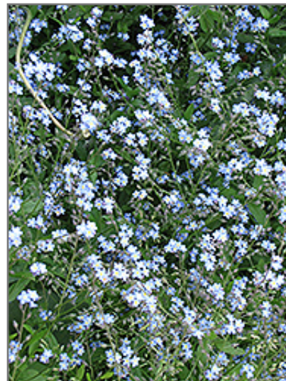
Forget-Me-Not in bloom