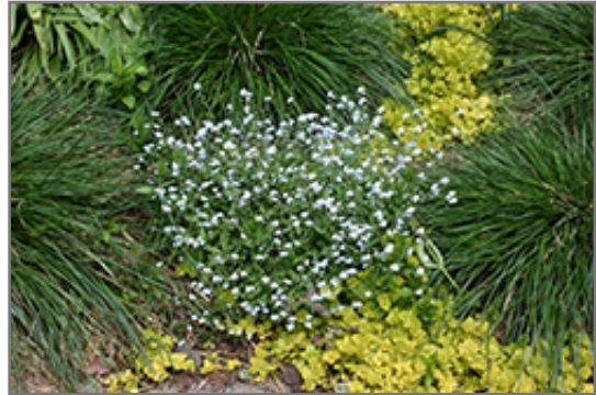
Forget-Me-Not in bloom

This plant does best in partial shade to shade. It prefers to grow in average to moist conditions, and shouldn't be allowed to dry out. It is not particular as to soil type or pH. It is somewhat tolerant of urban pollution. This species is not originally from North America.