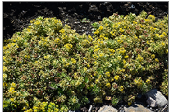
Rock 'N Low Boogie Woogie Stonecrop in bloom