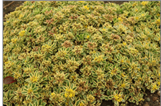
Rock 'N Low Boogie Woogie Stonecrop flowers

Rock 'N Low Boogie Woogie Stonecrop is a dense herbaceous perennial with a mounded form. Its medium texture blends into the garden, but can always be balanced by a couple of finer or coarser plants for an effective composition.