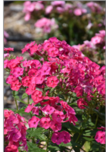
Ka-Pow Pink Garden Phlox flowers