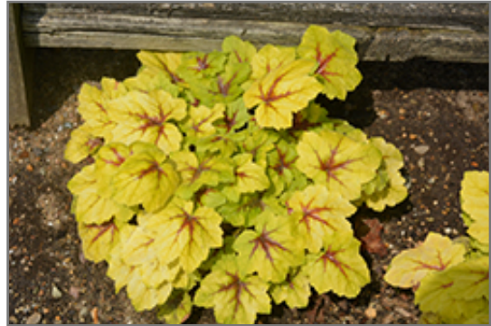
Catching Fire Foamy Bells

Catching Fire Foamy Bells is a dense herbaceous evergreen perennial with tall flower stalks held atop a low mound of foliage. Its medium texture blends into the garden, but can always be balanced by a couple of finer or coarser plants for an effective composition.