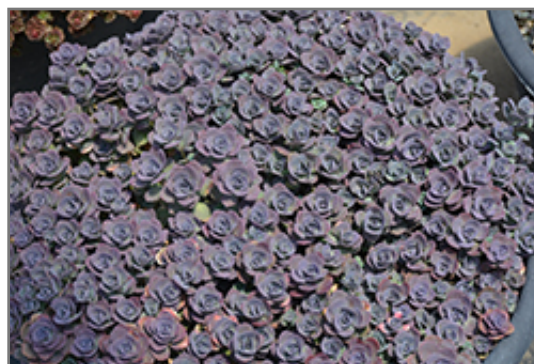
SunSparkler Blue Elf Sedoro