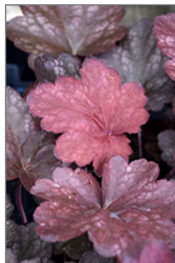
Carnival Candy Apple Coral Bells foliage