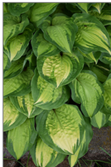
Island Breeze Hosta foliage

This is a relatively low maintenance plant, and is best cleaned up in early spring before it resumes active growth for the season. Gardeners should be aware of the following characteristic(s) that may warrant special consideration;