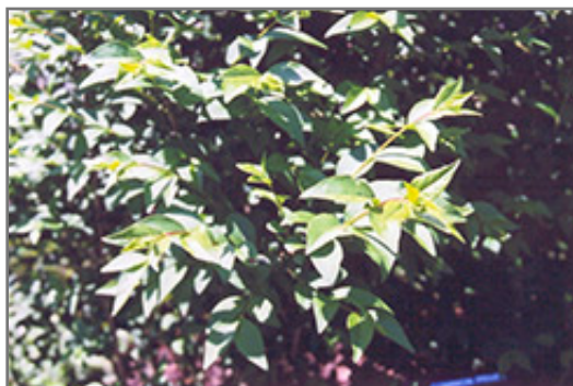
Common Privet foliage