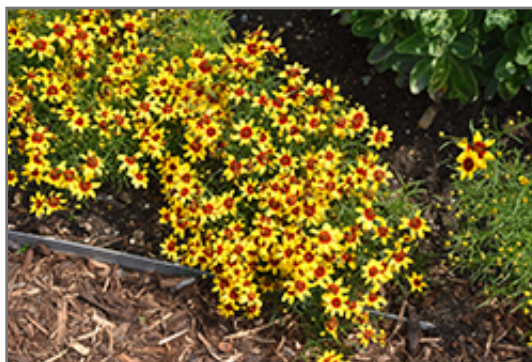
Sizzle And Spice Curry Up Tickseed in bloom