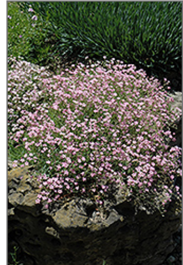
Pink Creeping Baby's Breath in bloom