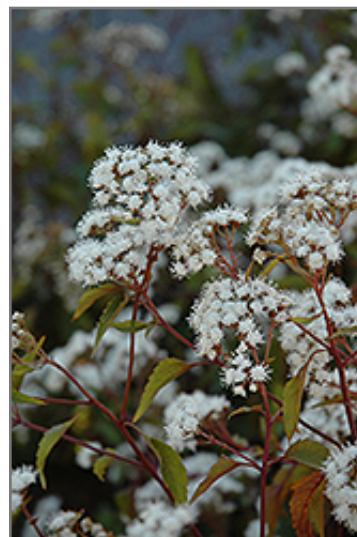
Chocolate Boneset flowers

This is a relatively low maintenance plant, and is best cleaned up in early spring before it resumes active growth for the season. It is a good choice for attracting butterflies to your yard, but is not particularly attractive to deer who tend to leave it alone in favor of tastier treats. It has no significant negative characteristics.