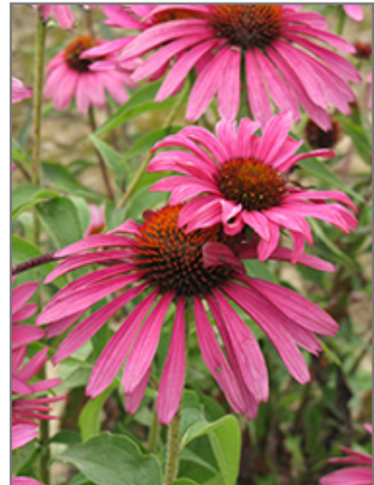
Ruby Star Coneflower flowers

Ruby Star Coneflower is recommended for the following landscape applications;