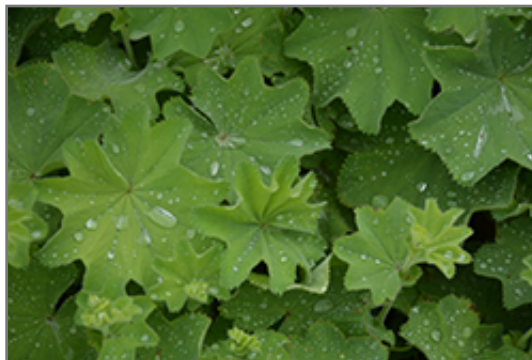
Lady's Mantle foliage

This plant performs well in both full sun and full shade. It is very adaptable to both dry and moist locations, and should do just fine under typical garden conditions. It is not particular as to soil type or pH. It is highly tolerant of urban pollution and will even thrive in inner city environments. This species is not originally from North America. It can be propagated by cuttings.