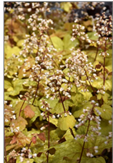
Champagne Coral Bells flowers