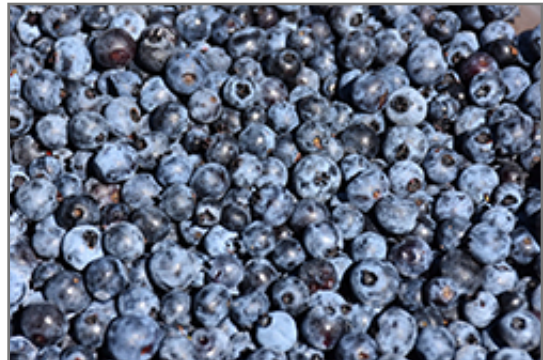
Lowbush Blueberry fruit

Lowbush Blueberry features dainty clusters of white bell-shaped flowers with shell pink overtones hanging below the branches in mid spring. It has dark green deciduous foliage. The oval leaves turn an outstanding scarlet in the fall. It features an abundance of magnificent blue berries in mid summer.