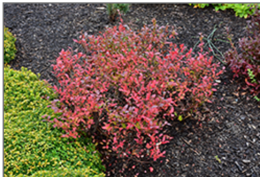
Lowbush Blueberry in fall

This shrub is typically grown in a designated area of the yard because of its mature size and spread. It performs well in both full sun and full shade. It does best in average to evenly moist conditions, but will not tolerate standing water. It is very fussy about its soil conditions and must have sandy, acidic soils to ensure success, and is subject to chlorosis (yellowing) of the foliage in alkaline soils. It is quite intolerant of urban pollution, therefore inner city or urban streetside plantings are best avoided, and will benefit from being planted in a relatively sheltered location. Consider applying a thick mulch around the root zone in winter to protect it in exposed locations or colder microclimates. This species is native to parts of North America.