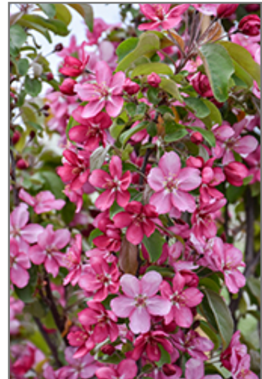
Red Barron Flowering Crab flowers

Red Barron Flowering Crab is recommended for the following landscape applications;