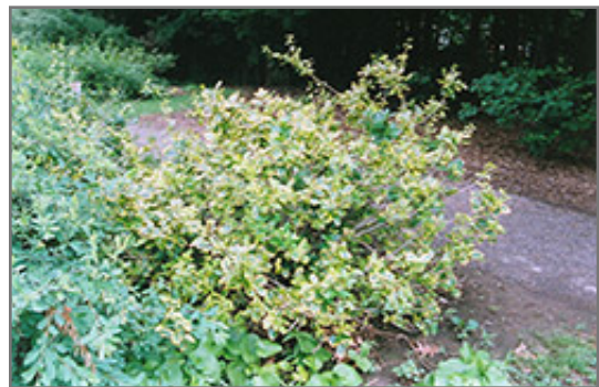
E.T. Gold Wintercreeper