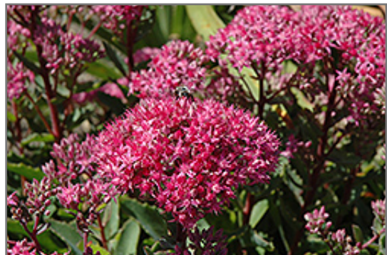
Carl Stonecrop flowers