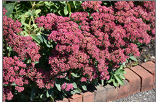
Carl Stonecrop in bloom

Carl Stonecrop is a dense herbaceous perennial with an upright spreading habit of growth. Its medium texture blends into the garden, but can always be balanced by a couple of finer or coarser plants for an effective composition.