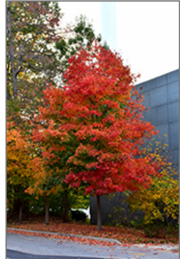
Fall Fiesta Sugar Maple in fall