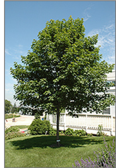
Fall Fiesta Sugar Maple

This tree should only be grown in full sunlight. It prefers to grow in average to moist conditions, and shouldn't be allowed to dry out. It is not particular as to soil pH, but grows best in rich soils. It is somewhat tolerant of urban pollution. This is a selection of a native North American species.