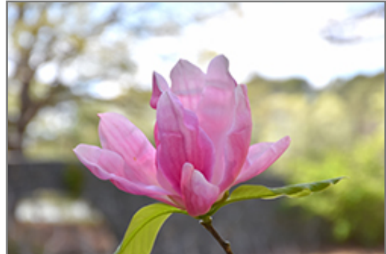
Daybreak Magnolia flowers

This tree does best in full sun to partial shade. It requires an evenly moist well-drained soil for optimal growth, but will die in standing water. It is not particular as to soil type, but has a definite preference for acidic soils. It is quite intolerant of urban pollution, therefore inner city or urban streetside plantings are best avoided. Consider applying a thick mulch around the root zone in winter to protect it in exposed locations or colder microclimates. This particular variety is an interspecific hybrid.