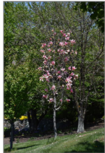
Daybreak Magnolia in bloom