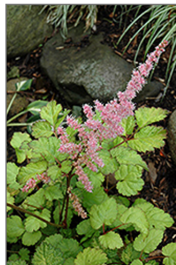
Amber Moon Chinese Astilbe flowers