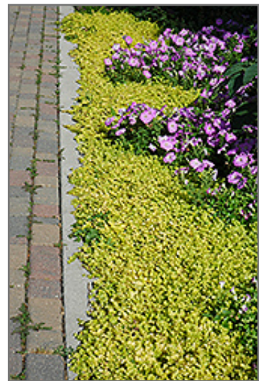
Golden Creeping Jenny