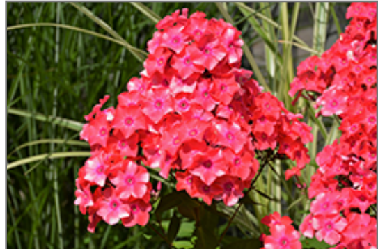
Flame Coral Garden Phlox flowers

Flame Coral Garden Phlox is a dense herbaceous perennial with an upright spreading habit of growth. Its medium texture blends into the garden, but can always be balanced by a couple of finer or coarser plants for an effective composition.