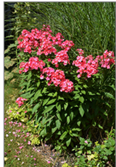
Flame Coral Garden Phlox in bloom