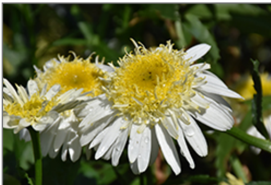
Realflo Real Glory Shasta Daisy flowers

Realflo Real Glory Shasta Daisy is recommended for the following landscape applications;