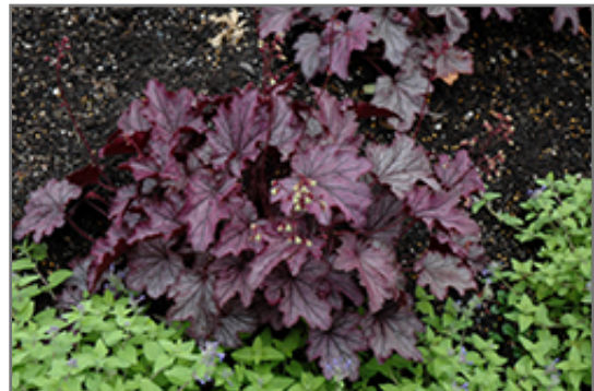
Spellbound Coral Bells