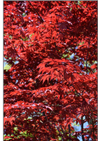
Emperor I Japanese Maple foliage