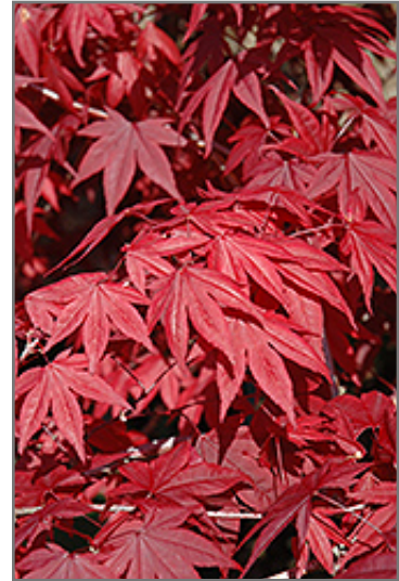
Emperor I Japanese Maple foliage

This plant is not reliably hardy in our region, and certain restrictions may apply; contact the store for more information.