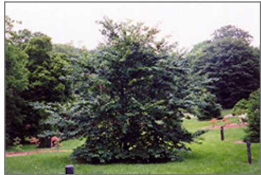
American Beech