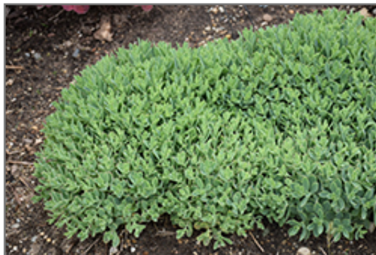
Rock 'N Round Pure Joy Stonecrop