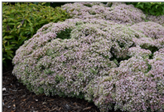
Rock 'N Round Pure Joy Stonecrop in bloom

Rock 'N Round Pure Joy Stonecrop is a dense herbaceous perennial with a mounded form. Its medium texture blends into the garden, but can always be balanced by a couple of finer or coarser plants for an effective composition.