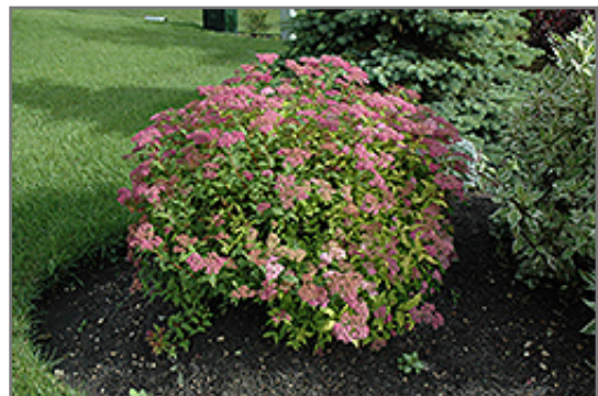
Goldflame Spirea in bloom